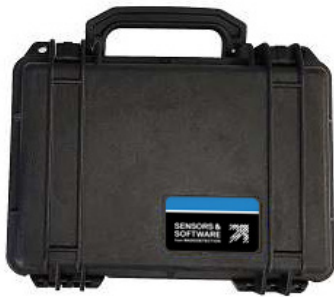
100-55-0023 Spare Battery