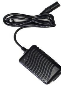
100-55-0027 Spare Battery Charger