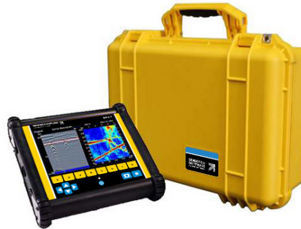
100-60-0066 Deluxe Display Unit Carrying Case