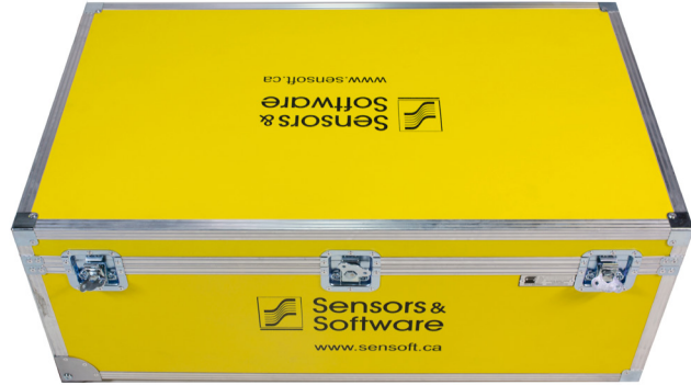
100-60-0058 LMX® Series ATA Shipping Case (with DVL Bag)