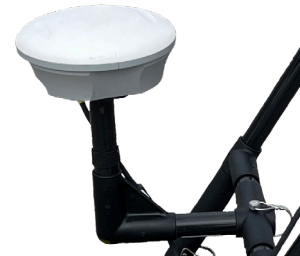
100-54-0150 AG-200 GPS Kit for LMX200™